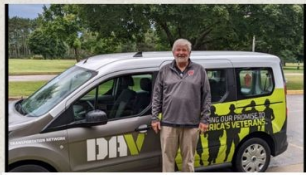
VOLUNTEER TRANSPORTATION NETWORK