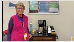
CBOC & COFFEE CARTS