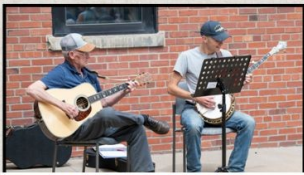
RECREATION & MUSIC